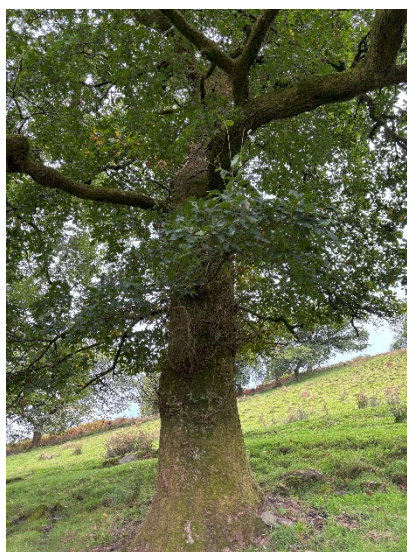
Photograph 10. Oak tree T9 with five PRF measures.