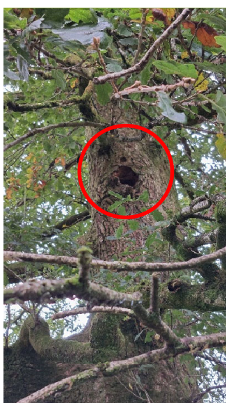
Photograph 11. PRF B on north-west aspect of oak tree T9, categorised PRF-M.