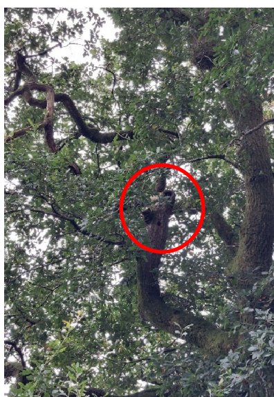
Photograph 12. PRFs C and D on western aspect of oak tree T9.