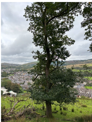
Photograph 7. Oak tree T4 with two PRF-I features on northern and south-east aspects.