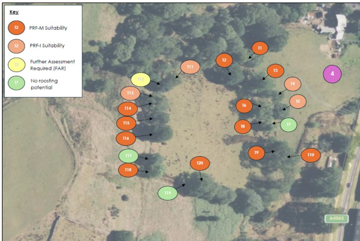
Figure 2. GLTA survey area at location 4 where trees will potentially be impacted by the proposed powerline route.