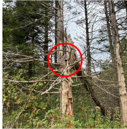
Photograph 2. Mature conifer with bat potential, hollow/woodpecker hole below collapsed limb.