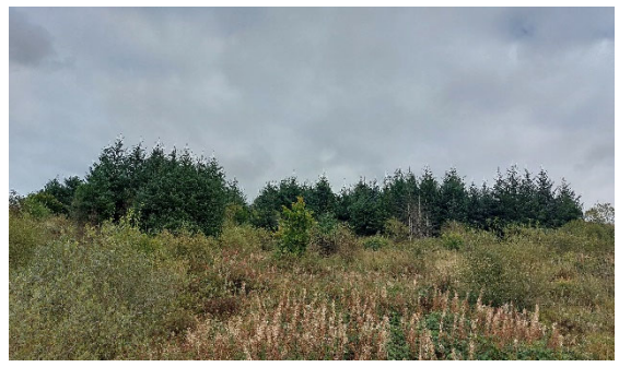
Photograph 4. View of eastern section of area 3 – replanted woodland, higher component of spruce.