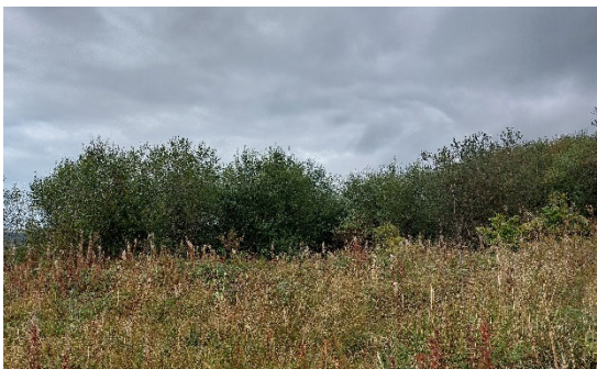
Photograph 3. View of western section of area 3 – scrubby replanted woodland, willow and oak.