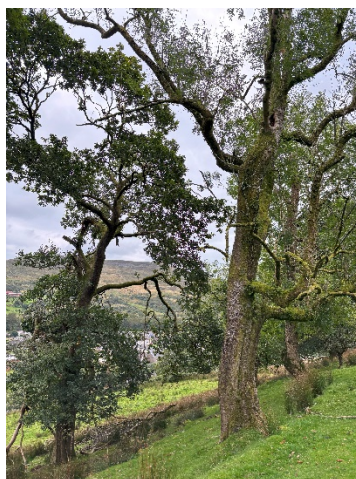
Photograph 8. Oak tree T5 and ash trees T6 and T8, with multiple PRF-I and PRF-M features.