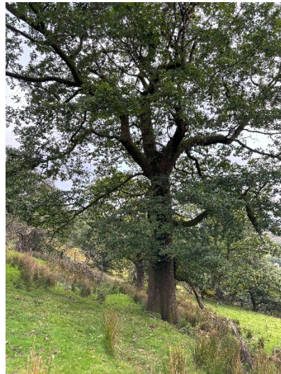
Photograph 6. Oak tree T3 in Area 4 with four PRF-M features on north, west and south aspects