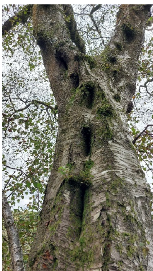
Photograph 9. Birch tree T11 with hollow in main stem before it splits at c.1m high.