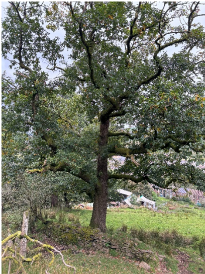
Photograph 5. Oak tree T1 in Area 4 with five PRF-M features on the south, north and west aspects