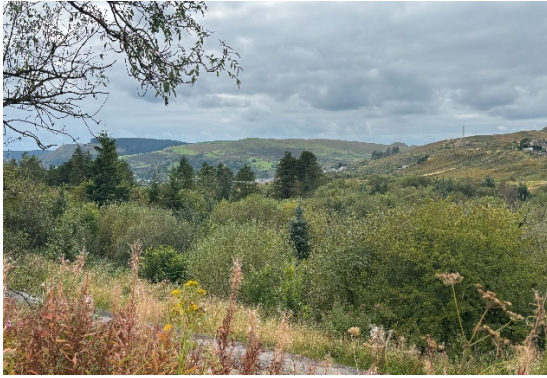
Photograph 1. View across woodland at survey area 2 – scrubby trees with large conifers on south-west periphery.